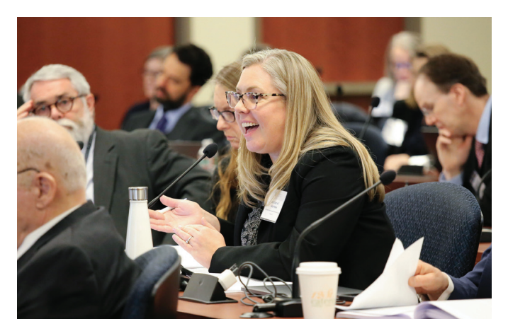
Principles of the Law, High-Volume Civil Adjudication