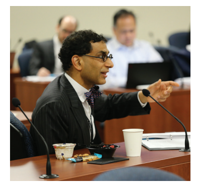
2019 project meeting

Both in the United States and in Europe, uncertainty as to the