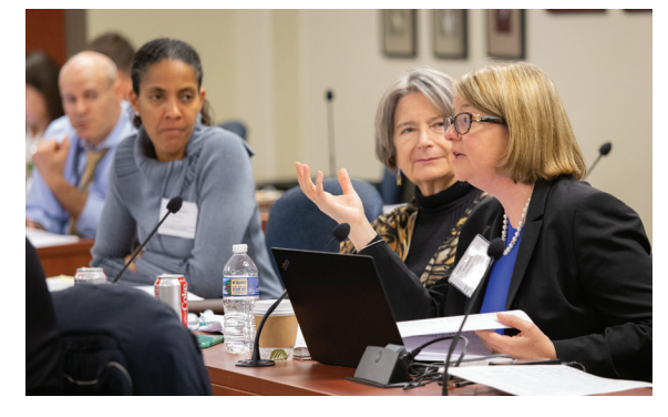
2018 project meeting

This project proposes a set of principles that may be implemented in any kind of legal environment, and are designed to work in conjunction with any kind of data-privacy/data-protection law, intellectual-property law, or trade-secret law, without addressing or seeking to change any of the substantive rules of those bodies of law.