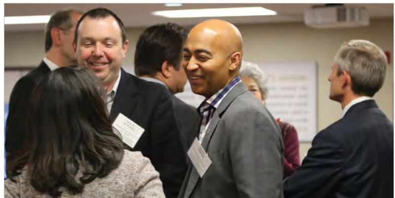
Principles of the Law, Data Privacy, project meeting