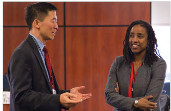
Restatement of the Law, Children and the Law, project meeting