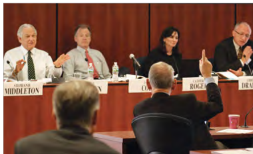
Restatement of the Law, The U.S. Law of International Commercial Arbitration, project meeting