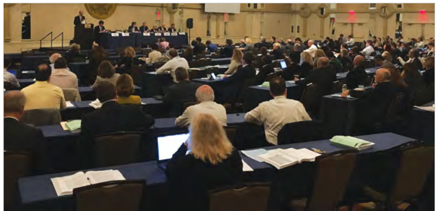
Life Insurance Company Products 2016, presented in Washington, DC, November 3-4, 2016

As ALI CLE looks to next year, it is positioning itself to capitalize on several opportunities. It is evaluating and will be upgrading its distance-learning delivery system to further improve the attendee experience. ALI CLE is also preparing to meet the needs of almost 20,000 Connecticut attorneys now required for the first time to fulfill a CLE requirement in 2017. Finally, ALI CLE is working with a premier learning management system (LMS) serving large law firms in order to integrate its programming into this popular tool. Placement within the LMS will make it easier for legal professionals to learn about and to attend ALI CLE events. Through these endeavors, ALI CLE continues to advance its reputation and role as the first-class CLE organization providing a national educational curriculum to the legal profession.