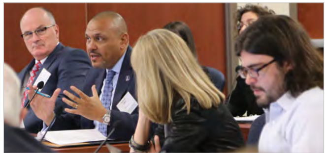
Principles of the Law, Policing, project meeting