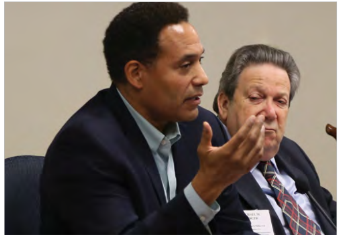
Restatement of the Law Fourth, Property, project meeting