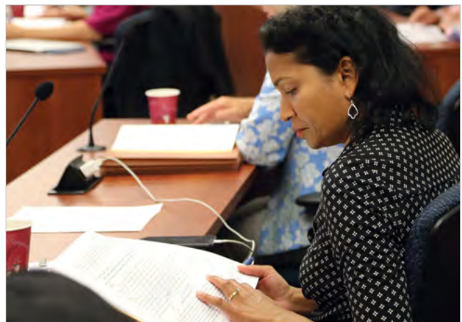
Principles of the Law, Compliance, Enforcement, and Risk Management for Corporations, Nonprofits, and Other Organizations, project meeting