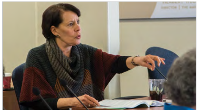
Restatement of the Law Third, Torts: Intentional Torts to Persons, project meeting