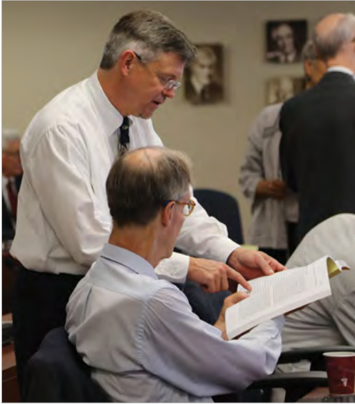
Restatement of the Law Third, Conflict of Laws, project meeting