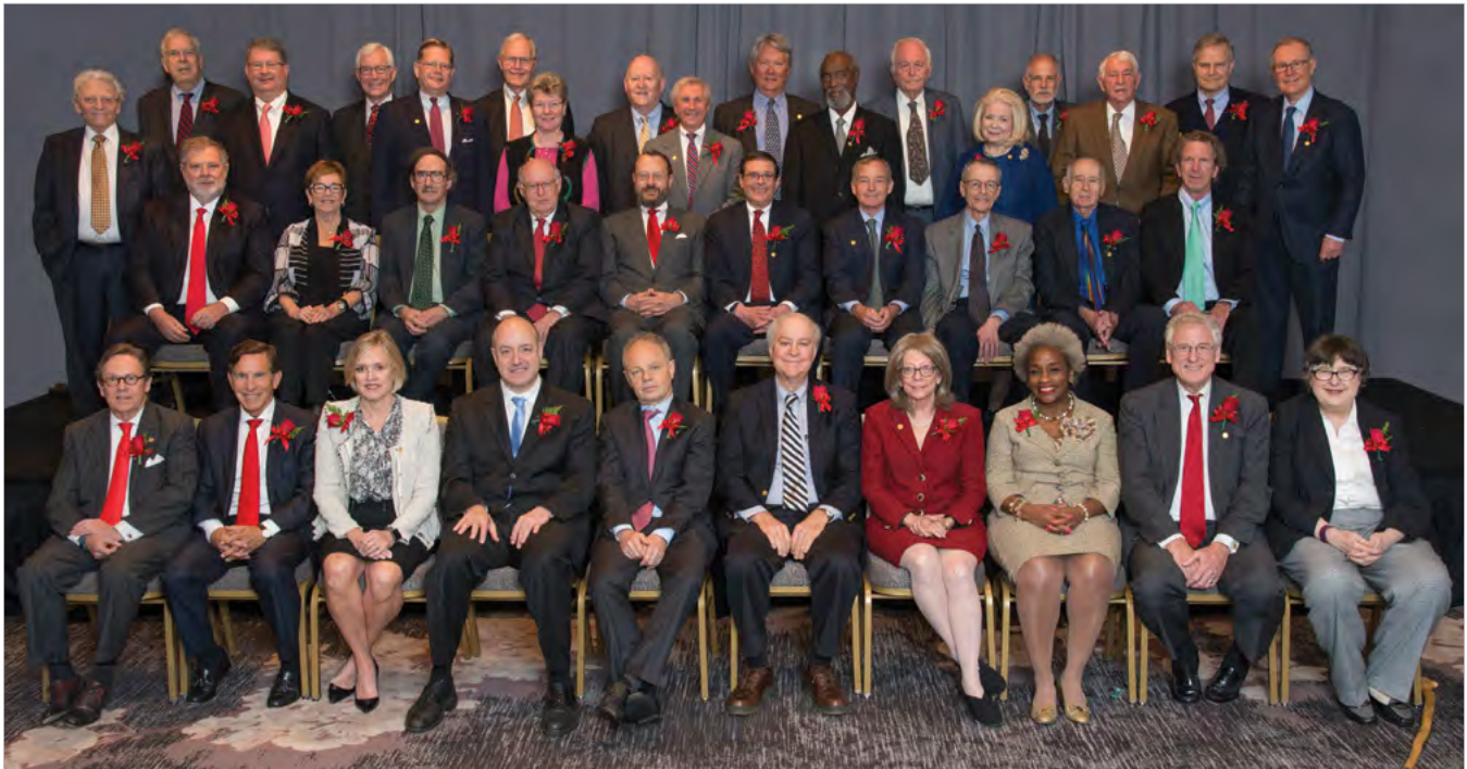
1991 and 1966 Class members gathered to celebrate 25 and 50 years with the Institute.