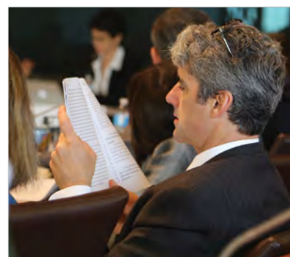
Project on Sexual and Gender-Based Misconduct on Campus: Procedural Frameworks and Analysis, project meeting