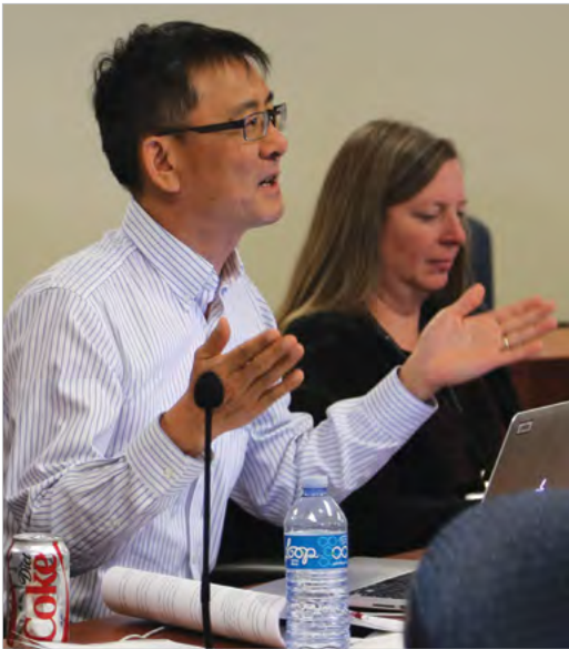
Restatement of the Law, Copyright, project meeting