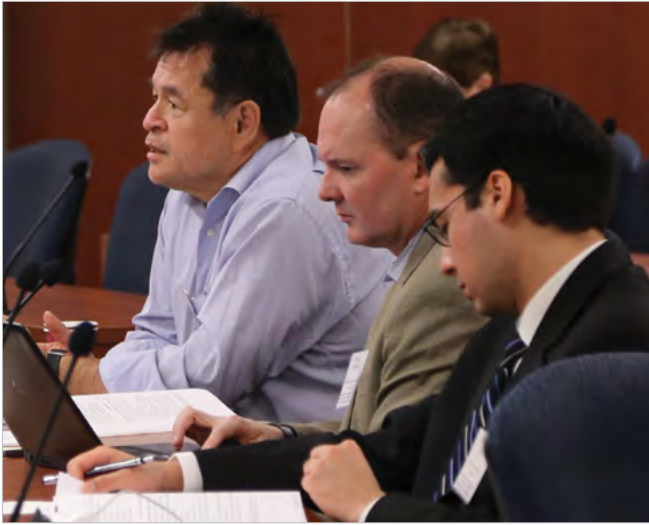
Restatement of the Law, The Law of American Indians, project meeting