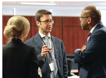
Conflict of Laws

It has been wonderful to be with you in person at our project meetings and the Annual Meeting. I look forward to seeing many more of you in the next year and beyond.