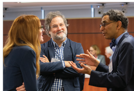
Torts: Defamation and Privacy

JOINING A PROJECT AND PARTICIPATING IN OUR MEETINGS GIVES ALL MEMBERS THE OPPORTUNITY TO MEET AND INTERACT WITH REPORTERS, ADVISERS, AND OTHER MEMBERS AND TO CONTRIBUTE SUBSTANTIVELY TO THE INSTITUTE'S WORK.