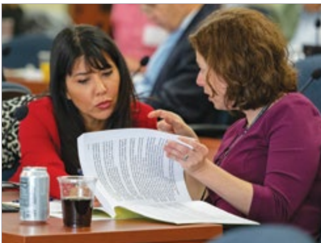
Model Penal Code: Sexual Assault and Related Offenses, project meeting

From time to time, the Permanent Editorial Board for the UCC issues PEB Commentaries to provide guidance in interpreting and resolving issues raised by the UCC. A PEB Commentary on Consignments was issued in January 2019.