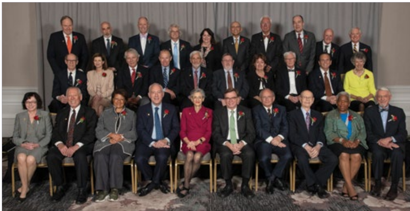
1994 and 1969 Class members gathered to celebrate 25 and 50 years with the Institute.