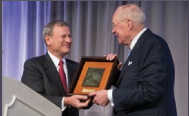
Chief Justice Roberts presents the Friendly Medal to Retired Associate Justice Kennedy

The full video of the medal presentation is available on the ALI website.