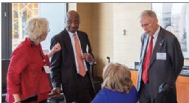
Restatement of the Law, Corporate Governance, project meeting