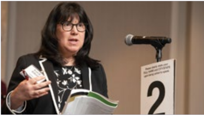
Restatement of the Law Third, Torts: Intentional Torts to Persons, Annual Meeting