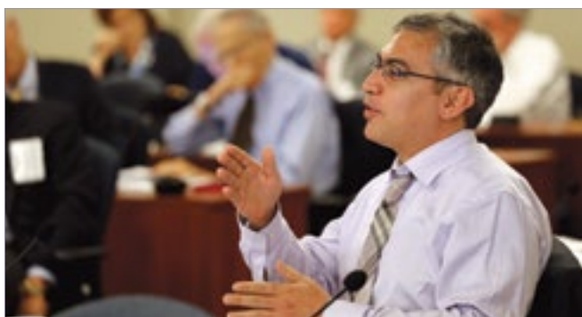
Restatement of the Law Fourth, Property, project meeting