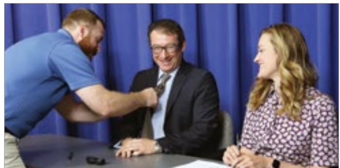
Nonprofits Restatement webcast recording