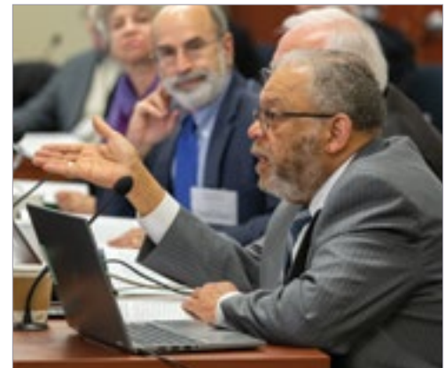
Principles of the Law, Policing, project meeting