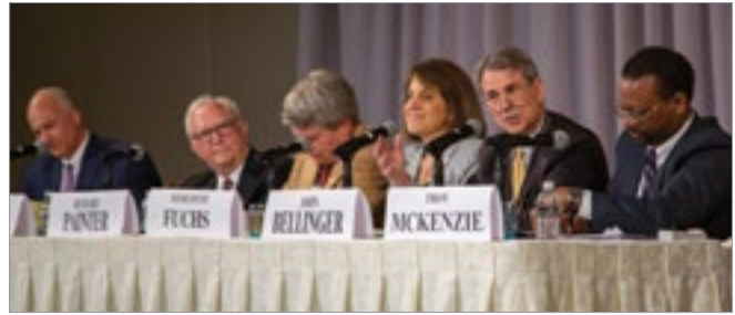
2019 Annual Meeting ALI CLE Program